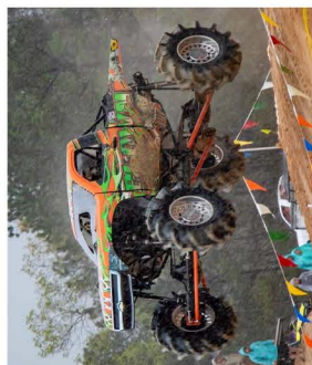
Mega Truck Freestyle